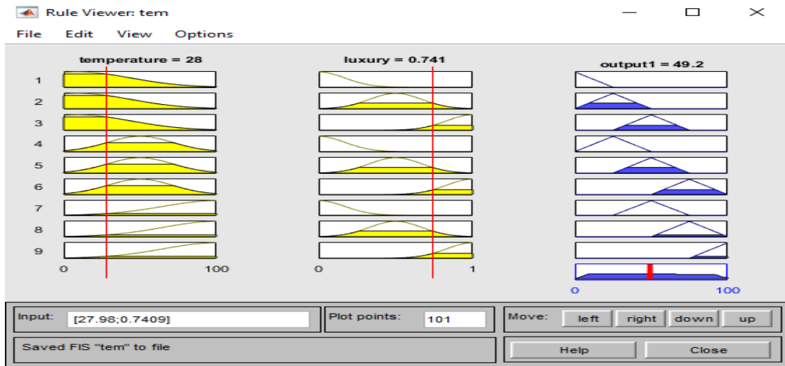
Figure 3: Outcomes of the Experiment